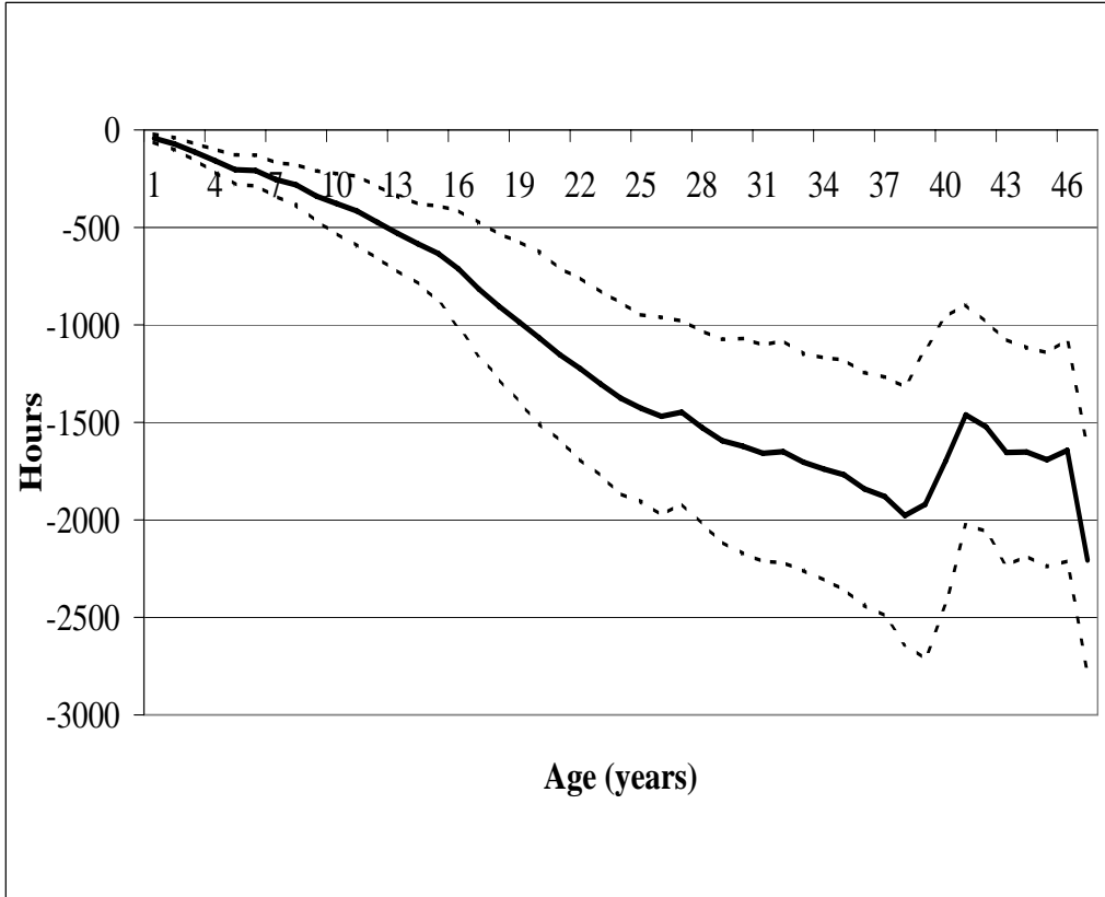
FIGURE 3: Annual hourly utilization as a function of aircraft age. Regression coefficients are calculated using year and aircraft-type fixed effects. 95% confidence intervals are calculated using standard errors that are clustered by aircraft type.